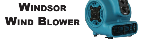
WINDSOR WIND BLOWER