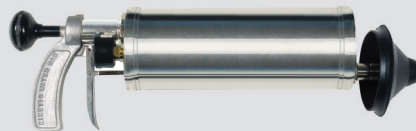
KINETIC WATER RAM