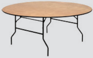
60" ROUND TABLES