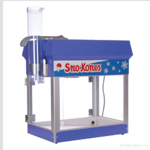
SNO KONE MACHINE