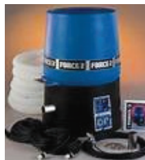
FIBER FORCE INSULATION BLOWER