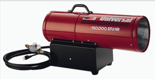
150,000 BTU PROPANE HEATER