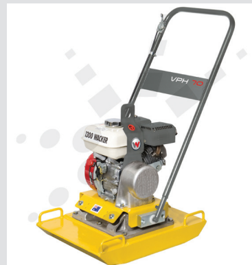
VIBRA PLATE COMPACTOR