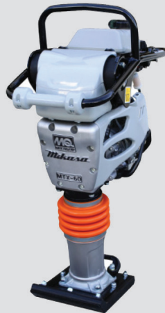
MIKASA JUMPING JACK