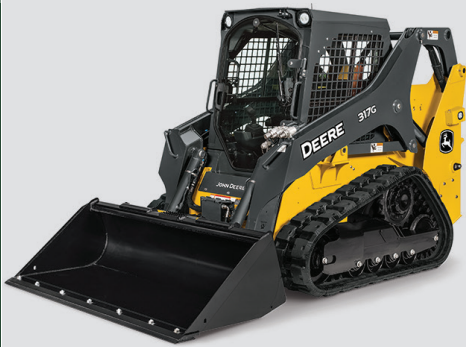
JOHN DEERE TRACK LOADER*