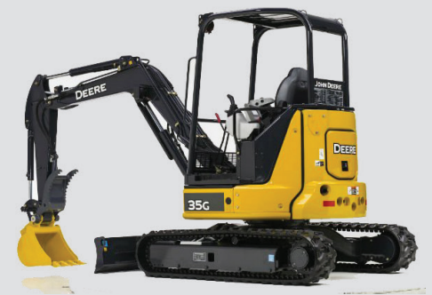
JOHN DEERE 35G MINI EXCAVATOR*