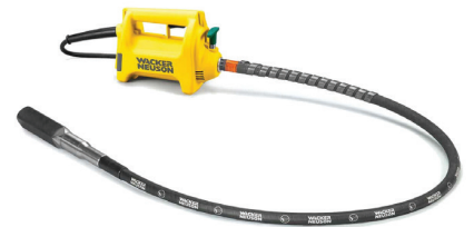
CONCRETE PENCIL VIBRATOR