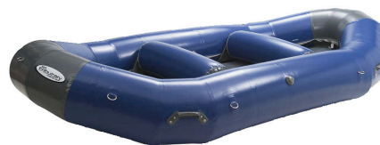
4-5 PERSON AIRE RAFT*