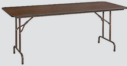
8' BANQUET TABLES