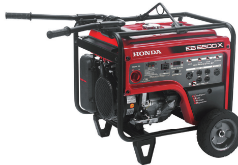
HONDA EB6500X GENERATOR