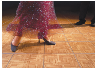
DANCE FLOOR 15'x15'