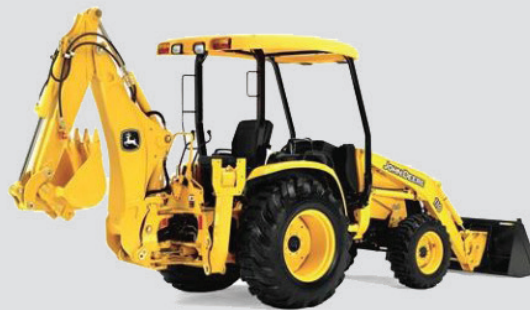
JOHN DEERE 110 BACKHOE*