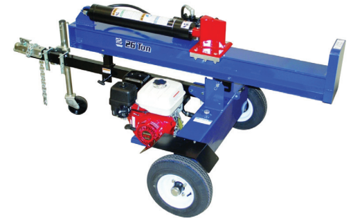
26-TON LOG SPLITTER*