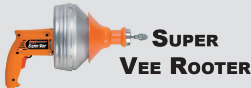
SUPER VEE ROOTER