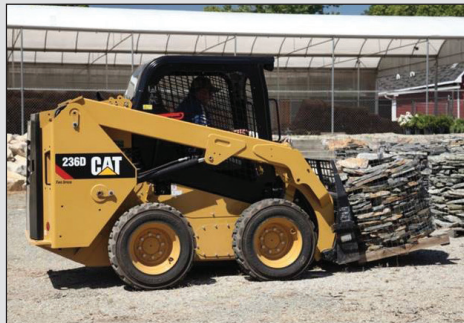
CAT SKID STEER 236D*/Open Cab