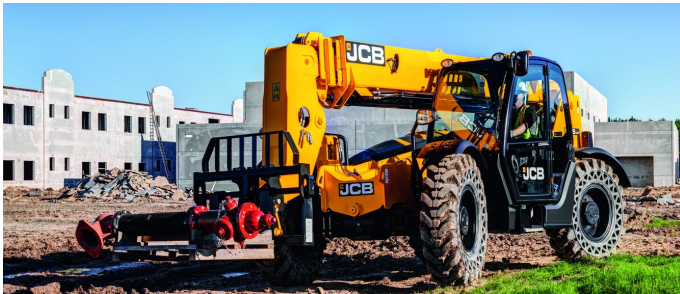
JCB TELEHANDLER 509-42