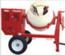
TOW BEHIND CONCRETE MIXER*