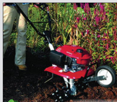
HONDA LIGHT DUTY TILLER