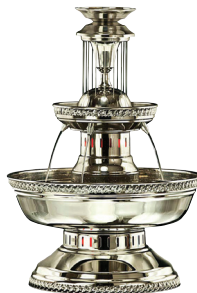
BEVERAGE FOUNTAIN 5 OR 7 GALLON